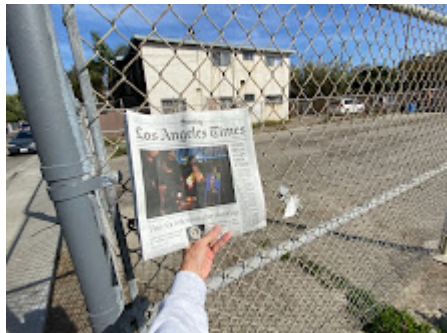
IMG_4131 (1).jpg 1325K